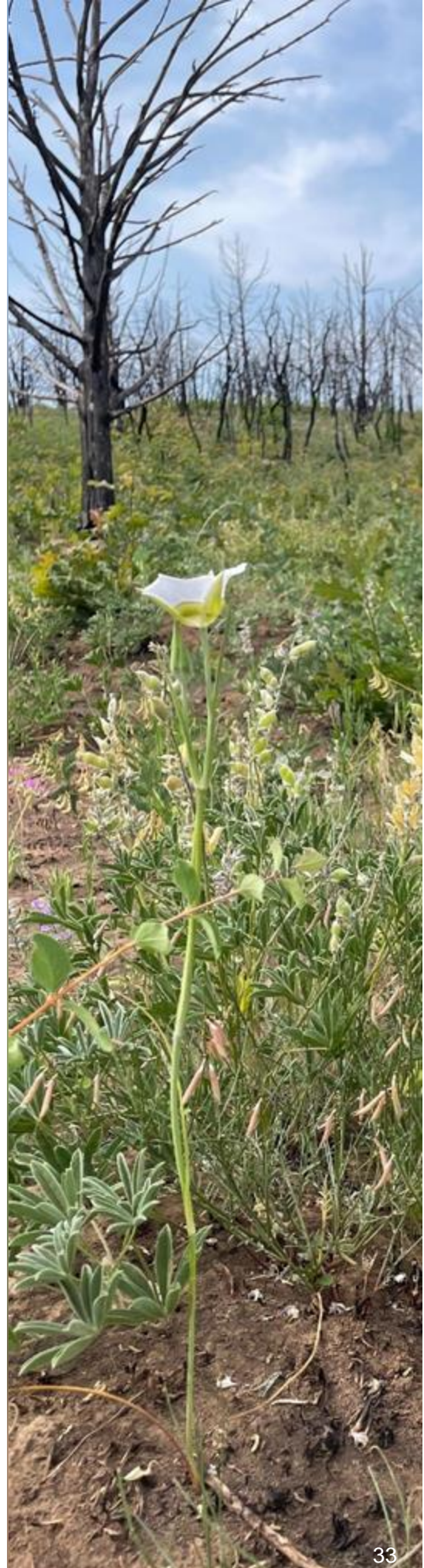
Sego lily emerges in the Pine Gulch Fire burn scar.